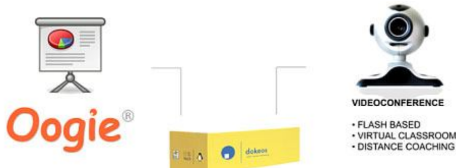
Fig.3.Dokeos Flash based video conferencing