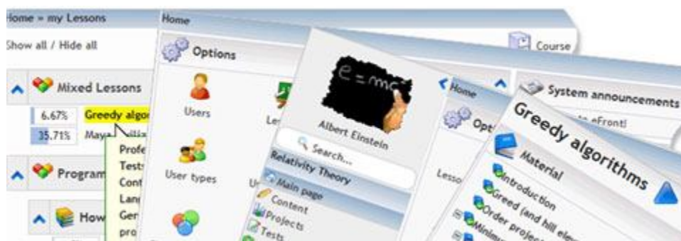
Fig.2.eFront with Ajax interface

eFront is a complete e-learning software with a good looking Ajaxed interface. It enables admin to create & manage lessons easily with various tools like: