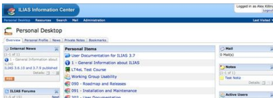
Fig.4.Ilias e-learning application