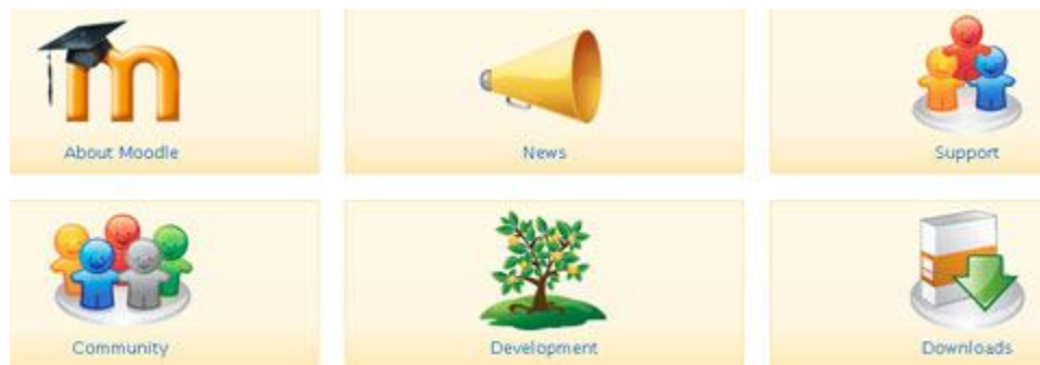
Fig.5.Features in Moodle