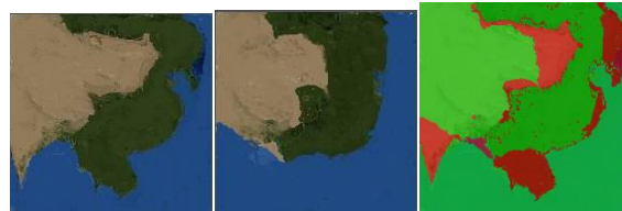
Pre event image Post event image Change Map Figure 3: Change detection

Accuracy of change detection is obtained by plotting the confusion matrix and it is found that this change detection method produced 85% accuracy.