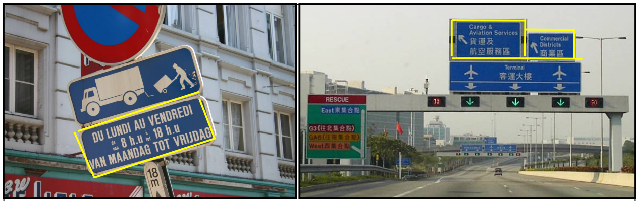
Figure 1 Traffic Image Containing Text

when contrasted with its lower partners, making the data extraction handle more helpful. For instance, from an occasion picture, it would be most enlightening to tag the picture with number of individuals, their 1 outward appearances and protests around them than with content related which depict the picture as family in the midst of a furlough or the date and area where the photo was taken.