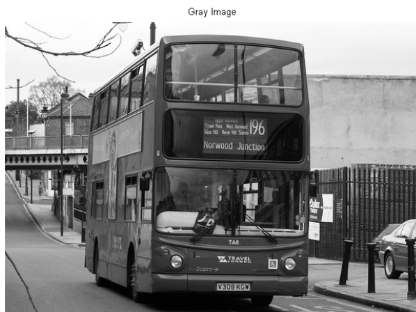
Figure 3: Color Converted Input Image

Using ANN classifier image is retrieved, which is shown in the Figure 4.