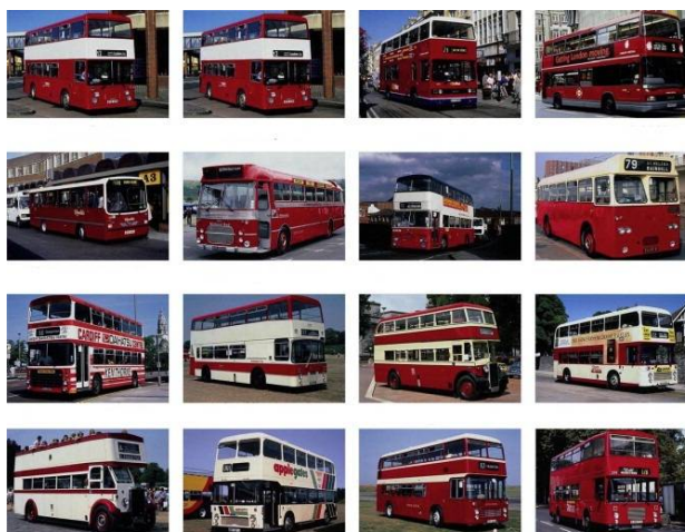
Figure 4: Retrieved Images

Using ANN classifier image is retrieved, which is shown in the Figure 4.