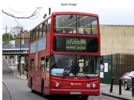
Figure 2: Input color image

Below Figure 2 shows the input image of testing phase. Input image is applied with pre-processing steps like color conversion as show in Figure 3.