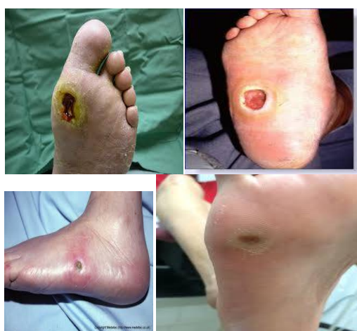
Figure 6.1 sample image

The Image capture process is captured analyzed by the wound image by using Smartphone and stored in JPEG file. The image is compress with binary image. The image preprocessing process is captured by wound image in order to remove the noise by using Gaussian filter. The Image segmentation process is the original image can be convert into RGB color image in divided by pixels (256*256). The Wound boundary detection process is detected by the wound in outline. The wound are identify color is used.