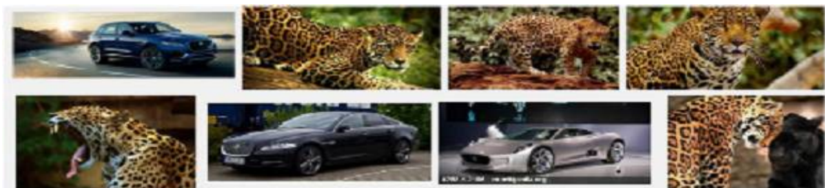
Figure 1: Top ranked images returned from Bing image search using "Jaguar" as query

Many commercial image search engines in the internet use only keywords as queries. Users type query keywords as input in the hope of finding a certain type of images they search for. The search engine returns images in thousands that are ranked by the keywords extracted from the surrounding text. It is well known that text-based image search process suffers a lot from the ambiguity of query keywords. The keywords provided by users tend to be short and mostly not commonly known. For example, the average query length of the top 2,000 queries of Picsearch is 1.369 words, and 95% of them contain only one or three words. They cannot describe the content of images accurately and perfectly. The search results are noisy and ambiguous consist of images with quite different semantic meanings. Fig 1 shows the top ranked images that are ranked from Bing image search using "Jaguar" as query. They belong to different categories, such as "Blue Jaguar car", "Black Jaguar car", "Jaguar logo", and "Jaguar animal", due to the ambiguity of the word "Jaguar". The ambiguity issue occurs for so many reasons. First, the query keywords that the user searching for, meanings may be richer than users' expectations. Consider this, the meanings of the word "Jaguar" includes Jaguar animal and Jaguar car and Jaguar logo. Second, the user may not have enough knowledge about the textual description of target images he/she searching for.