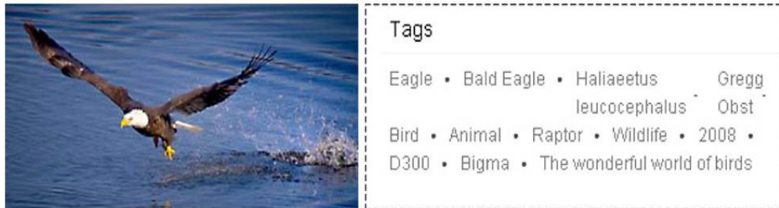
Figure 2: An example of a social image with its associated tags

The most importantly, in many scenarios, it is difficult for users to explain the visual content of queried images using keywords accurately. In order to solve the ambiguity issues, additional information has to be use.