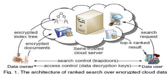
Fig. 1. The architecture of ranked search over encrypted cloud data