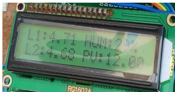
Fig.3: LCD Display.

The real setup is shown in the fig.2 we are using two DC stepper motors for rotating solar panel the angle of rotation is based on the LDR's values, the LDR 1 and LDR 2 sensors data is collected and processed by the controller then compare these two LDR's values. Which LDR value has higher value in that side the solar panel will be rotated. Battery is used for two purposes: 1) It can store energy, 2) Discharge the energy while solar power is not present. A voltage divider circuit is used for measuring the current, how much current can be drawn from the solar panel. The solar controller device controls and manages the power supplies.