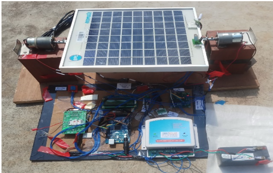
Fig.2: Real setup of solar panel efficiency monitoring system.

The real setup is shown in the fig.2 we are using two DC stepper motors for rotating solar panel the angle of rotation is based on the LDR's values, the LDR 1 and LDR 2 sensors data is collected and processed by the controller then compare these two LDR's values. Which LDR value has higher value in that side the solar panel will be rotated. Battery is used for two purposes: 1) It can store energy, 2) Discharge the energy while solar power is not present. A voltage divider circuit is used for measuring the current, how much current can be drawn from the solar panel. The solar controller device controls and manages the power supplies.