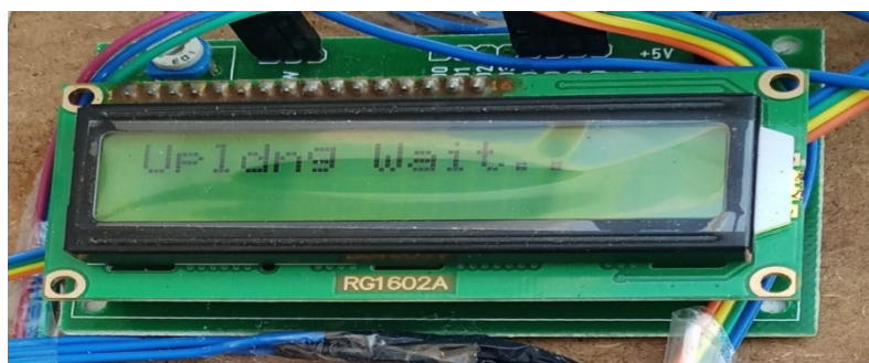
Fig.4:Uploading the data to sever.

The Efficiency of Solar panel monitoring real setup is shown Fig.3By using this setup we can analyze the efficiency of solar panel in different time interval over a period of time. Based on the result of the analysis we can utilize the load. In these two DC motors are attached to two sides of solar panel that are rotating perfectly based on the sun shine. Solar controller device is using to control the battery and input power supply of loads. The value of the solar panel voltage, Two Light Dependent Resistors (LDR) values and Humidity value is displayed on the LCD screen continuously that is shown in figure Fig.3.