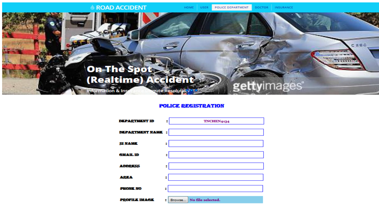
fig 1.2 Police Registration Form