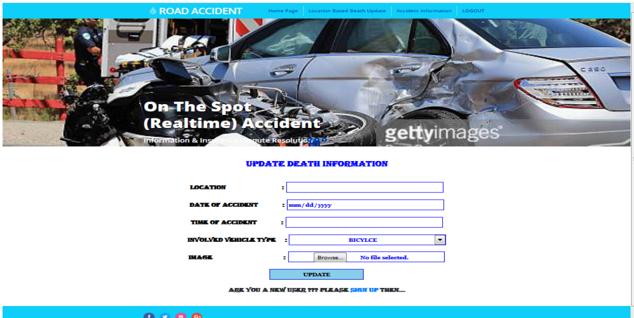
fig 1.3 Death Information Updation