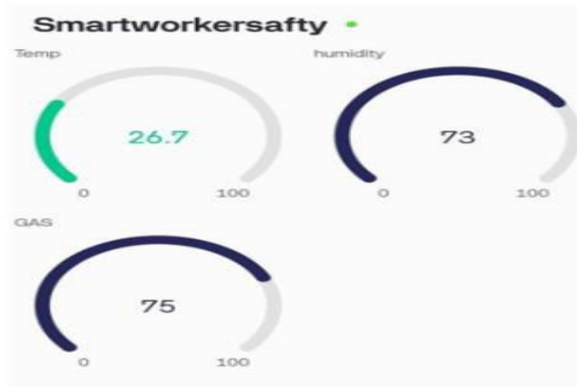
Figure 5: Blynk IoT Gauge Display

(A Monthly, Peer Reviewed, Refereed, Scholarly Indexed, Open Access Journal)