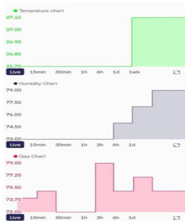
Figure 4: Blynk IoT Graph Showing Real-time Sensor Data

Overall, the results demonstrate that the MineGuard system effectively provides real-time monitoring, early hazard detection, and rapid alert mechanisms. This significantly improves situational awareness and safety for miners working in hazardous underground environments.