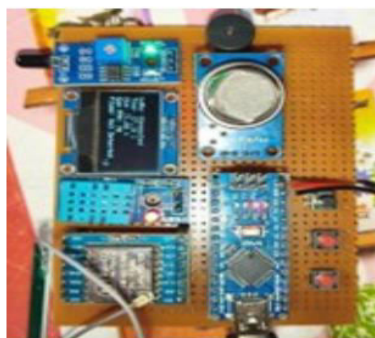
Figure 2: Sender Module

The system was tested to evaluate sensor accuracy, LoRa communication stability, emergency alert functionality, and IoT visualization. Experimental results demonstrate that the proposed system can effectively provide real-time monitoring, early hazard detection, and rapid emergency alerts, significantly improving the safety of miners working in underground environments.