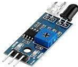
Image of IR Sensor Module

IR sensors are a vital component of many electronic devices, from smartphones and remote controls to security systems and medical equipment. Here are a few pictures of different types of IR sensors: