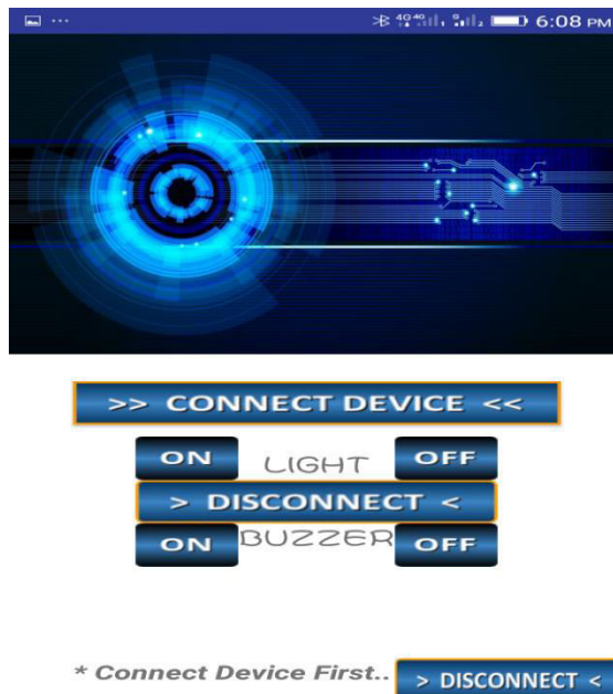
Figure3. Finding the BLE Enable Device

Figure 2 represents android application receives that device signals up to 50 devices. For example, in a 10-second examining period, given a telecom interim of 100 milliseconds, there ought to have been 100 readings, or 10 readings for each second. We found that generally gadgets can get around 80% of the readings, as appeared in Figure 2. Based on the experimental results, we found that most devices can receive about 90% of the readings. One can abbreviate the broadcasting interim to expand the quantity of estimations or on the other hand drag out the estimation window, in this manner diminishing the battery life of reference hubs or decreasing the responsiveness of computations, which are the separate outcomes.