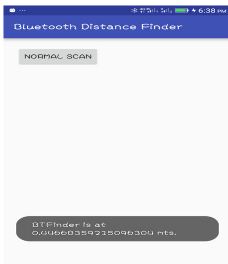
Figure 4. BLE Enable Device Distance

Figure 4 shows Distances between the two BLE enabled Devices and android Application by using the creating the connection between them by using Socket System calls. Once establish the connection receive RSSI Signals refer the Table 1 find out the Distances Using Algorithm.