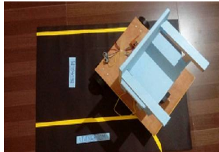
Figure 4: shows the RIGHT command