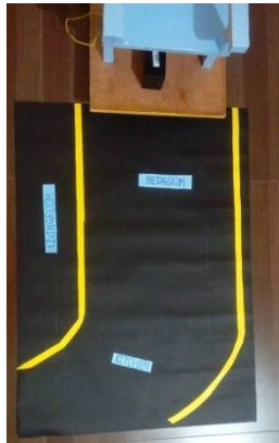
Figure 2: shows the starting position of wheel chair

The whole setup sits at the base of the wheelchair which has two wheels. These wheels are attached to the motors to move the wheels.