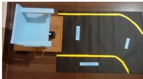
Figure 3: shows the REVERSE command