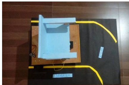
Figure 3: shows the FORWARD command

After giving the commands from android application, the all working position of wheel chair are shows follows: