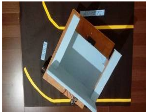
Figure 5: shows the LEFT command

Table 1: shows the Arduino response time for all movements: forward, reverse, left, right, stop. The digital output given by these movements to Arduino board.