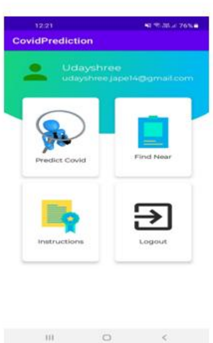
FIG 1: DASHBOARD