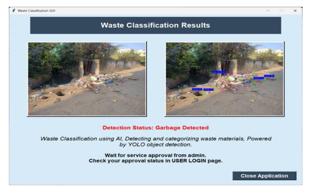
SCREEN 2: - Click close application to User Dashboard

SCREEN 1: If there is garbage in the image it will show Garbage detected