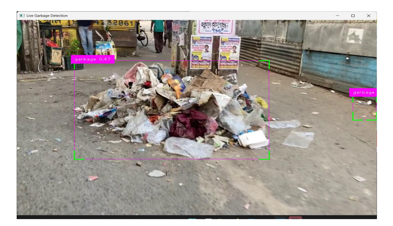
SCREEN 4: Video will be playing and Garbage has detected in live