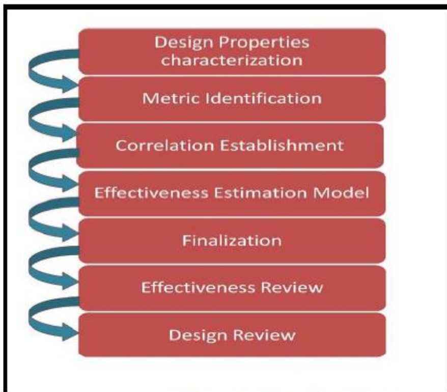
Fig 1: Effectiveness Estimation Framework: Design Phase Perspective