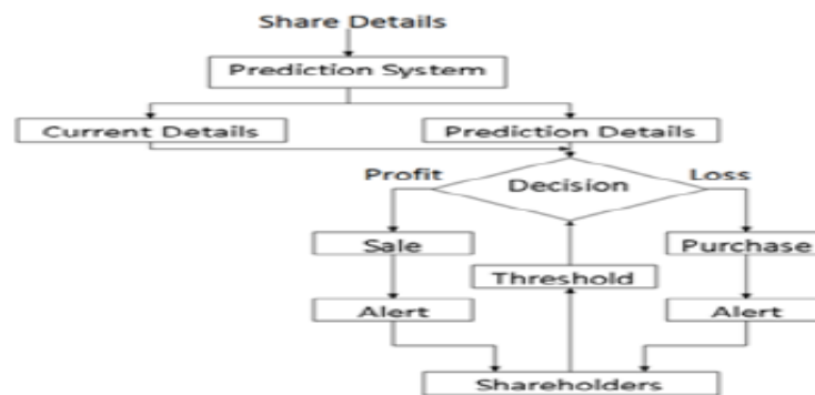
Fig. 1 - Flow Chart For Stock Market