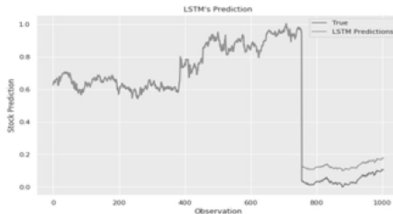
Fig.2 - LSTM Prediction model

This paper's neural network model was utilized and Long Short Term Memory (LSTM) which is a kind of Sequential and ANN[5]. A Sequential is likewise a kind of neural network model with many types of a straightforward neural network structure, and it has continued in circles that can move between various states state at the season of making neural network structure exceptionally simple