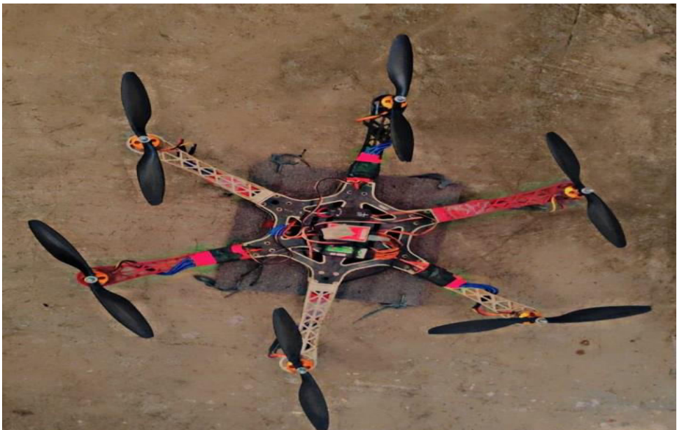
Fig 2: Hardware set of Intelligent Surveillance and night patrolling Drone

The drone fly in suitable and selected locations where it should monitor and surveillance the whole area. The drone will be furnished with a camera to give perceivability around the night tine. It has ability to capture night vision, so we can live video in our handheld phone or PC. This will additionally assist with keeping away from theft and it can likewise be utilized by forces for observation of friendly or unfriendly places where it absurd to expect to study genuinely for monitoring people. We can handle the drone utilizing RC distant. At the point when drone is worked in air it gives the live film of the environment factors with assistance of radio signs it can communicate sings to the administrator just as get the signs from the administrator. The live film can be seen on screen by the administrator or the host, who is working with drone. Pitch, Roll are the working catches on the RC distant which gives the entrance robot to move around noticeable all around.