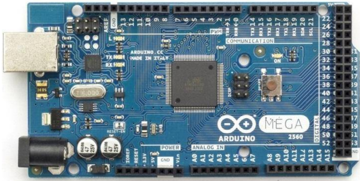
Fig 2. Arduino Kit