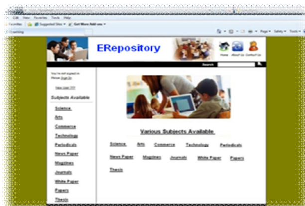
Figure1: Unregistered User

http://localhost:1282/Erepos/Index.php in the browser we will get the page in our Browser which is shown Fig 1 . For a unregistered user