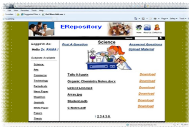
Figure5: Registered Faculty

SCENARIO 6: When a logged in Faculty/Research Scholar click on Post a question link Faculty/Research Scholar will get page like shown in Figure6 .