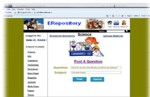
Figure6: Registered Faculty Post a Question

SCENARIO 6: When a logged in Faculty/Research Scholar click on Post a question link Faculty/Research Scholar will get page like shown in Figure6 .