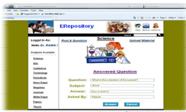
Figure8: Registered Faculty Answer Question

SCENARIO 8: When a logged in Faculty/Research Scholar clicks on Answered question link Faculty/Research Scholar will get page like shown in Figure8 . This page will help the Faculty/Research Scholar to answer the posted questions.