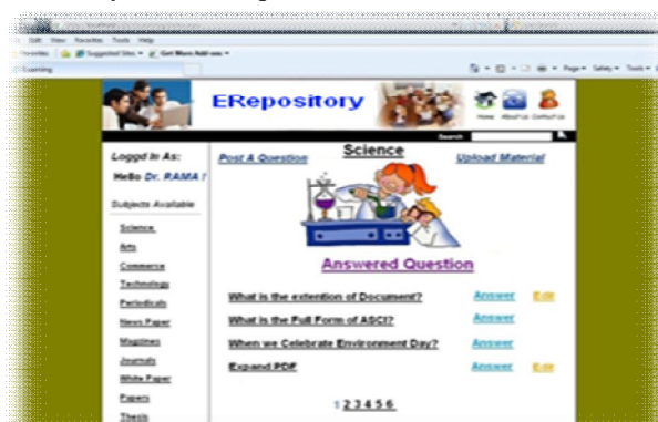
Figure9: Registered Faculty Answered Question

SCENARIO 9: When a logged in Faculty/Research Scholar clicks on Answered question link Faculty/Research Scholar will get page like shown in Figure9 . This page will help the Faculty/Research Scholar answer the asked questions and also able to edit the already answered questions