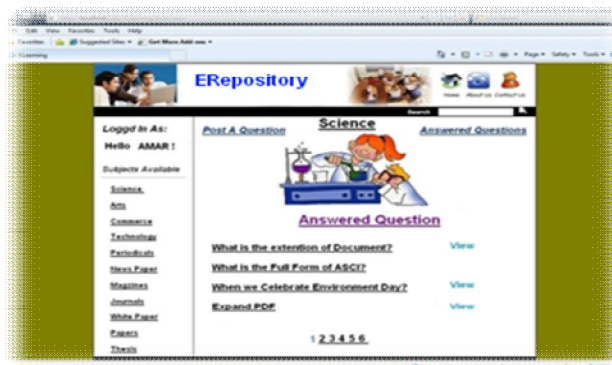
Figure4: Registered User Answered Question

SCENARIO 4: When a logged in student click on Answered question link student will get page like shown in Figure4.