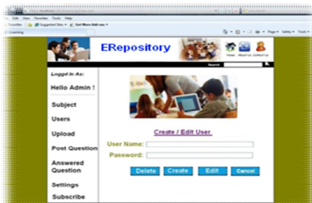
Figure10: Admin Create/ Edit Faculty/Student/Research Scholar

SCENARIO 10: When logged with admin credentials and admin user click on create user admin will get the page shown in Figure 10 . So here admin will able to Create, Edit and Delete the users like Faculty, Research Scholar, and Students etc.