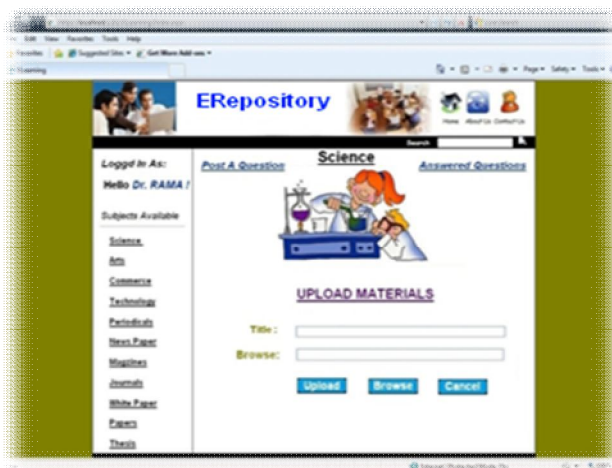
Figure7: Registered Faculty Upload

SCENARIO 7: When Logged in Faculty/Research Scholar click on Upload link Faculty/Research Scholar will get page like shown in Figure7 .