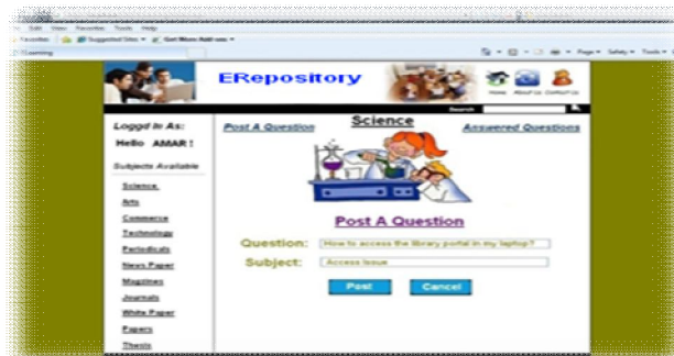
Figure3: Registered User Post a Question

SCENARIO 3: When a logged in student click on Post a question link student will get page like shown in Figure3.